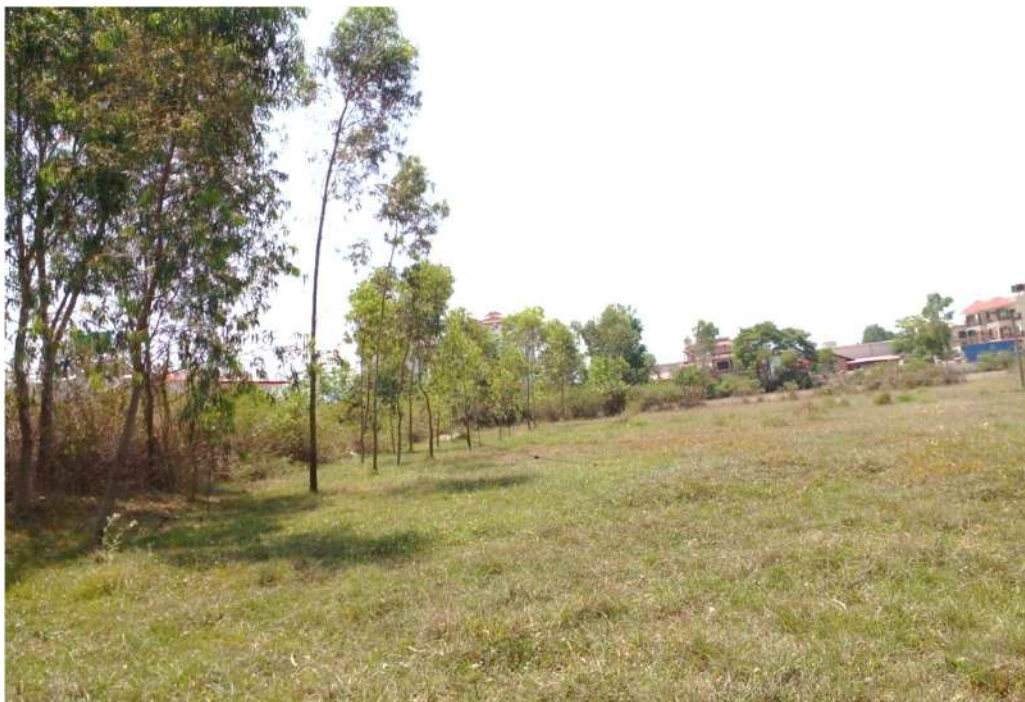
Photo 2: Eucalyptus Trees to be cleared at Data and Internet Exchange Centre, Khumaltar, Lalitpur Location