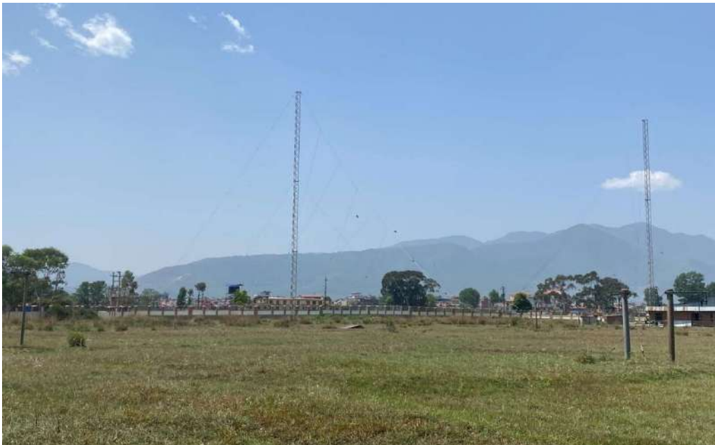
Photo 4: Unused Medium Wave radio Nepal towers to be dismantled at Data and Internet Exchange Centre, Khumaltar, Lalitpur