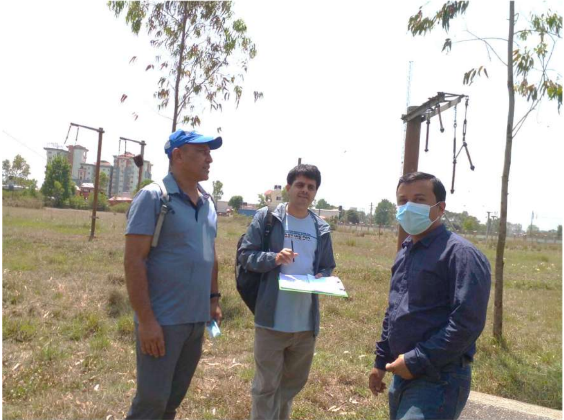
Photo 5: Consultation with NITC officer at Data and Internet Exchange Centre, Khumaltar, Lalitpur