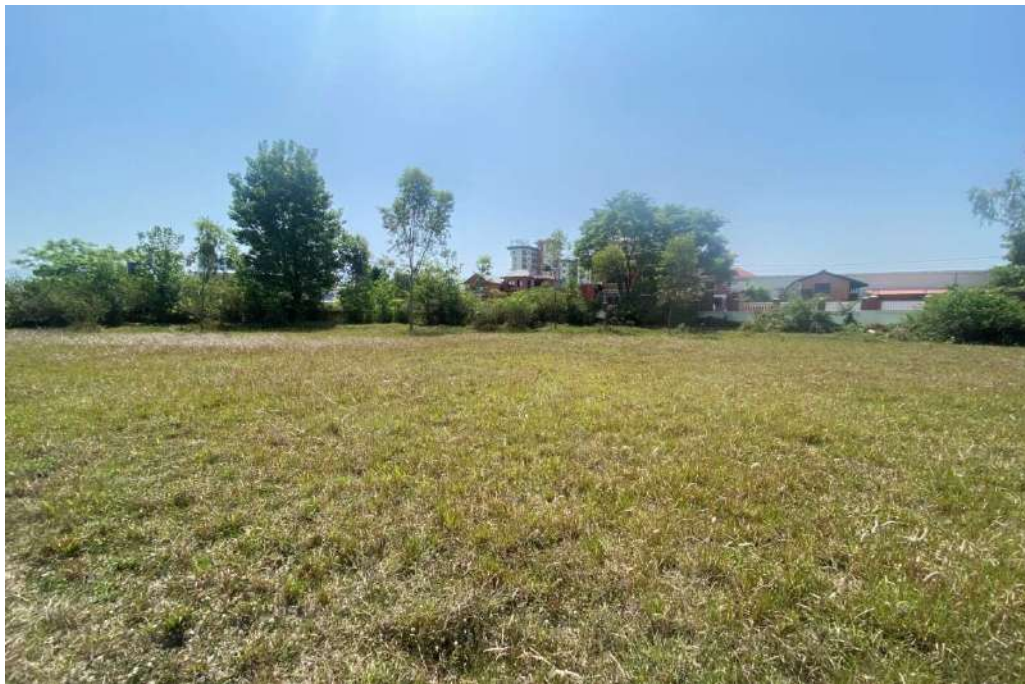
Photo 1: Location of Data and Internet Exchange Centre, Khumaltar, Lalitpur with adjacent settlement