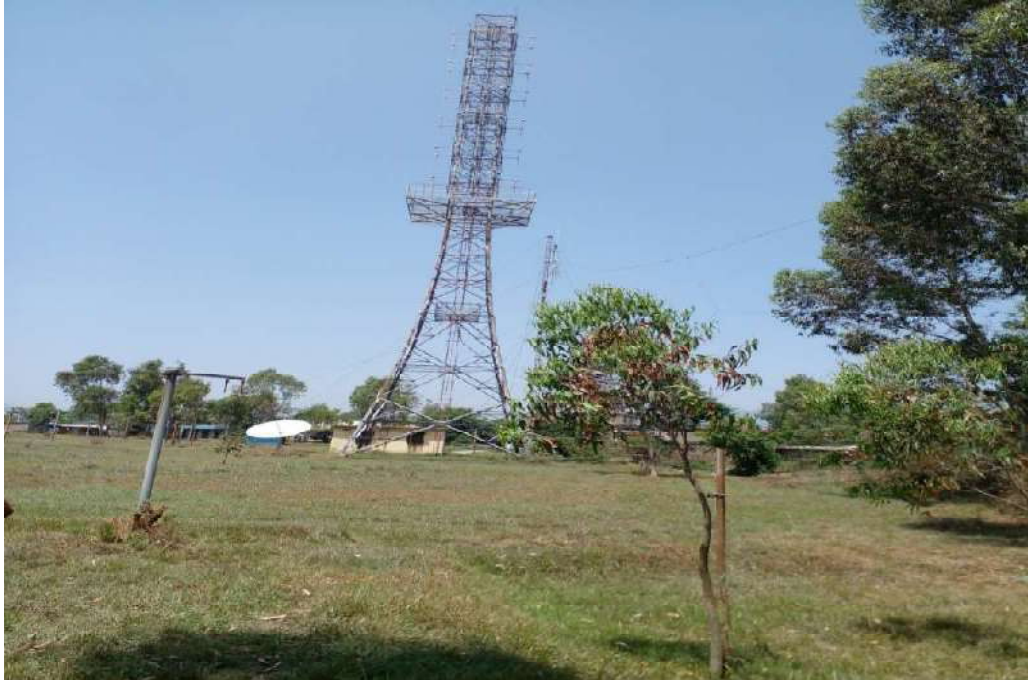
Photo 3: Radio Nepal /FM tower adjacent to Data and Internet Exchange Centre, Khumaltar, Lalitpur location