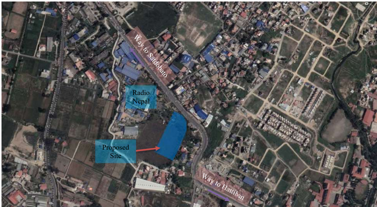
Figure 1: Location Google Map of the proposed data Centre

Data and Internet Exchange Center, Khumaltar, Lalitpur is proposed to be constructed within the compound of Radio Nepal in ward no. 5 of Lalitpur metropolitan city. The design of proposed centre has included different components standardized structures to provide required services like data storage, sharing computing resources, email/ internet, and website hosting, which are general function of any data center, to all the government ministries and departments, and a physical location through which Internet infrastructure companies such as Internet Service Providers (ISPs) and CDNS connect with each other. The building is designed following applicable National Building code. The structural system chosen for the building is with ductile RCC structural walls with RCC steel moment resistant frame. Details of components features and location Google map is presented in as below: